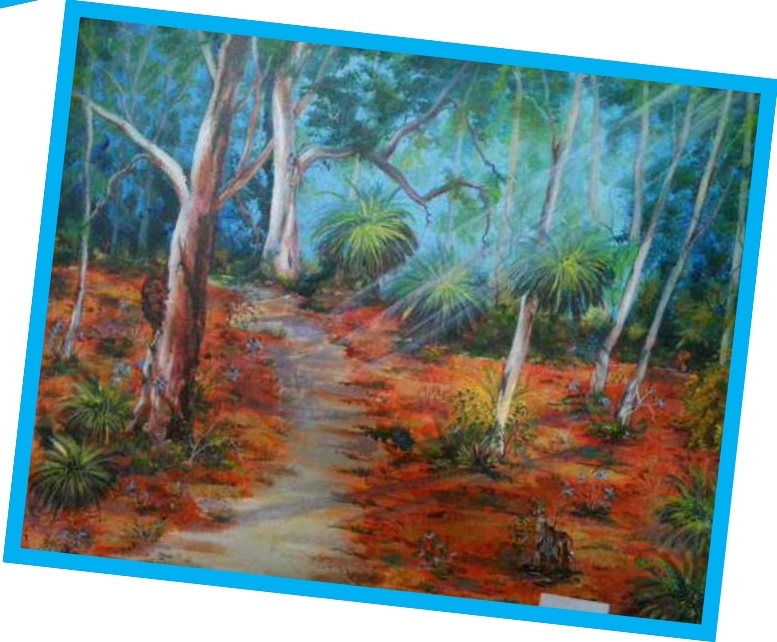
Gwen Powning →