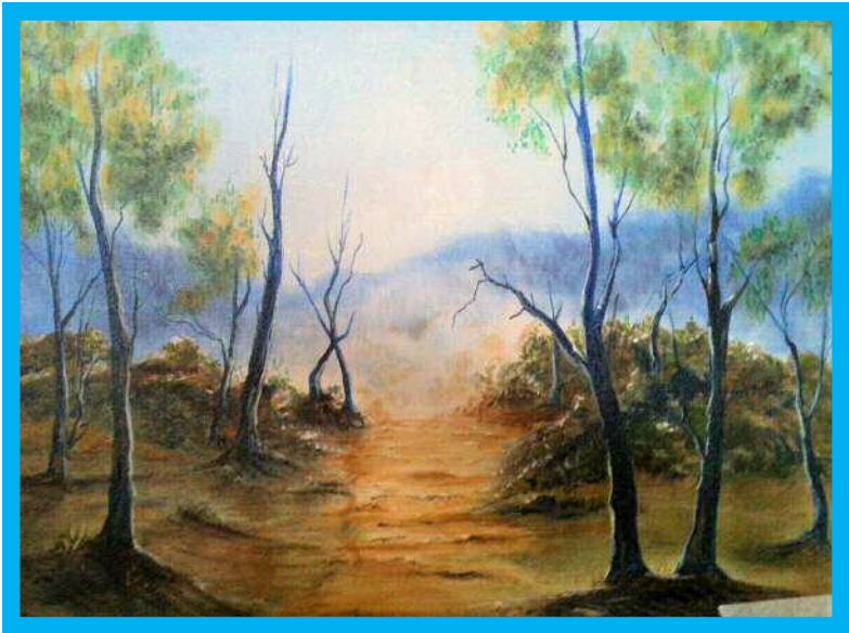
← Bev Theodore